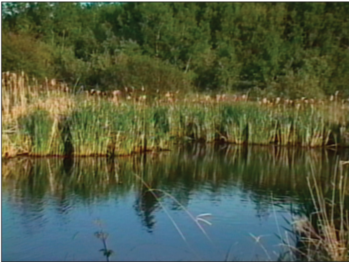
watertremble 2013 6'11"

Beauty as truth: wetlands and the sentience of birds that inhabit them. This footage, although it may be gathered on many back roads, is more difficult to realize than it might seem. Saskatchewan artist Allan Sapp noted, "painting is a feeling"--an observation that can also apply to video acquisition.