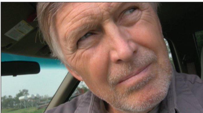
self-portrait 2014 23"

This is a companion piece to Pond two . Again, the soundtrack is a mix of music with location sound.